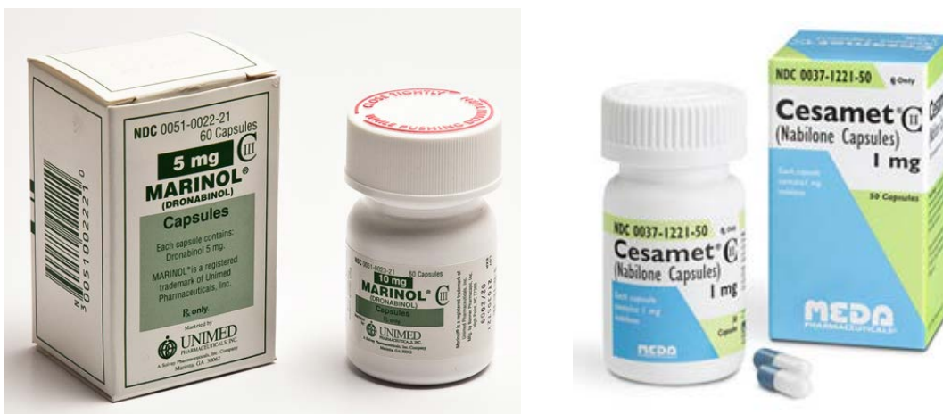
Oral cannabinoids for the treatment of chemotherapy-related nausea and AIDS wasting. Approved by FDA in the 1980s.

The NAS committee reviewed 10,700 abstracts of marijuana studies conducted since 1999, when it issued its last report on marijuana science. For therapeutic use, it finds that oral cannabinoids (dronabinol, nabilone, and others), but not marijuana, are effective for only two conditions: adults with chemotherapy-induced nausea and vomiting and multiple sclerosis (MS)-related spasticity. Oral cannabinoids, and in a handful of studies smoked or vaporized research-grade marijuana, have been shown to relieve symptoms of certain kinds of pain. For these three conditions, the effects are modest, says the committee. "For all other conditions evaluated, there is inadequate information to assess their effects" (emphasis added), including epilepsy and most of the other conditions states have legalized marijuana to treat. (Research-grade marijuana is grown at the University of Mississippi under a contract from the US National Institute on Drug Abuse. Unlike "artisanal" marijuana that states are legalizing for medical use, research-grade marijuana is free of contaminants and provides a reliable, consistent dose each time it is used.)